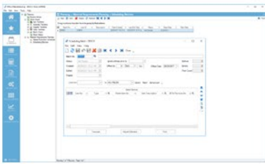
Auto-forecast sales based on actual sales history

If you need to plan your production and purchasing activities weeks, months, even years in advance, you'll want to license the Material Requirements Planning (MRP) module. With just a few mouse-clicks, you can create a detailed Master Production Schedule which analyzes your current inventory in the context of open purchase orders, work orders, manufacturing orders, and (optionally) sales orders. Spot impending shortages while there is still time to respond. Click again to create all the required purchase orders and production orders. MRP has never been easier.